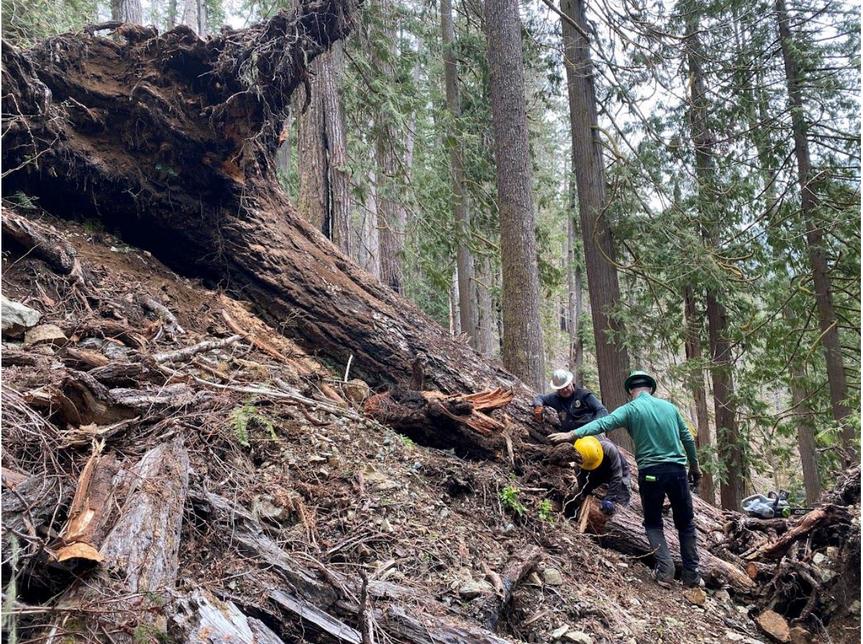
CUTTING AND MOVING A LOG THAT WAS RIGHT NEXT TO THE TREE.