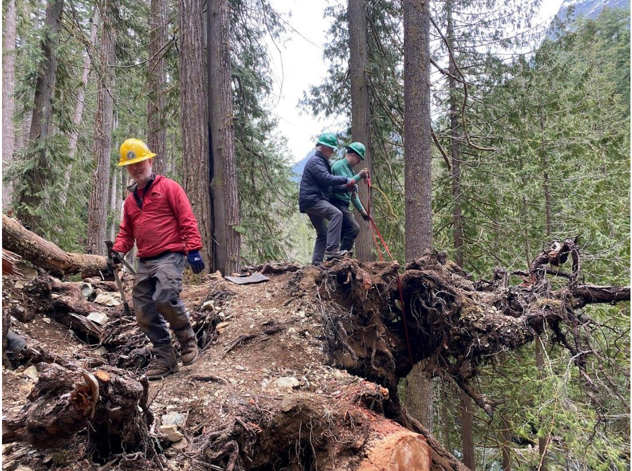
“FLOSSING” THE UNDERSIDE OF THE ROOT TO CLEAN OFF THE DIRT AND ROCKS.