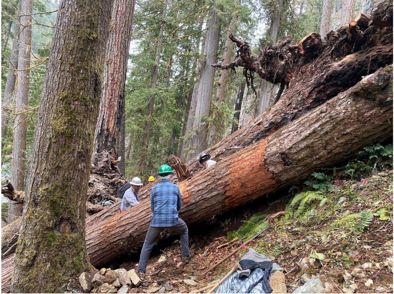
STARTING THE DEBARKING OF THE TREES.