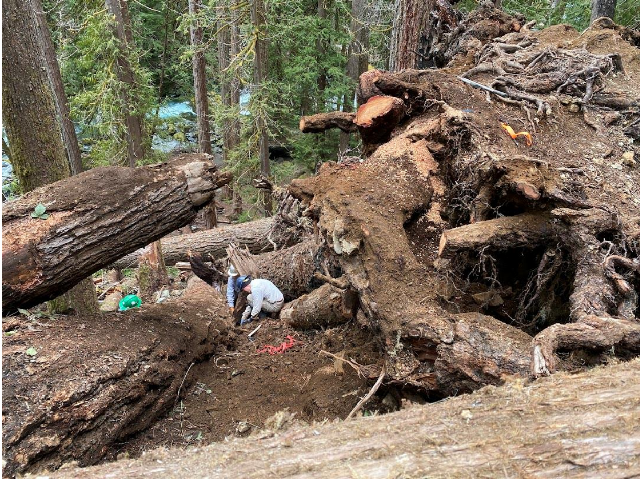
CLEANING OUT THE TREE AND EMBEDDED BRANCH (ROOT?) AND ROCKS THAT WERE BETWEEN THE TREES.