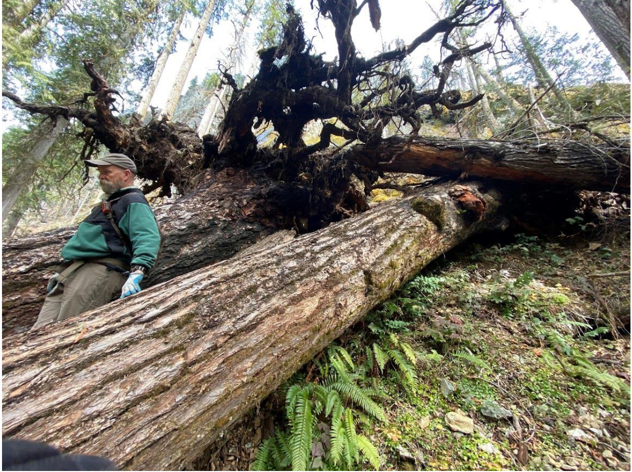
PERSPECTIVE FOR THE STEEPNESS OF THE TREES.