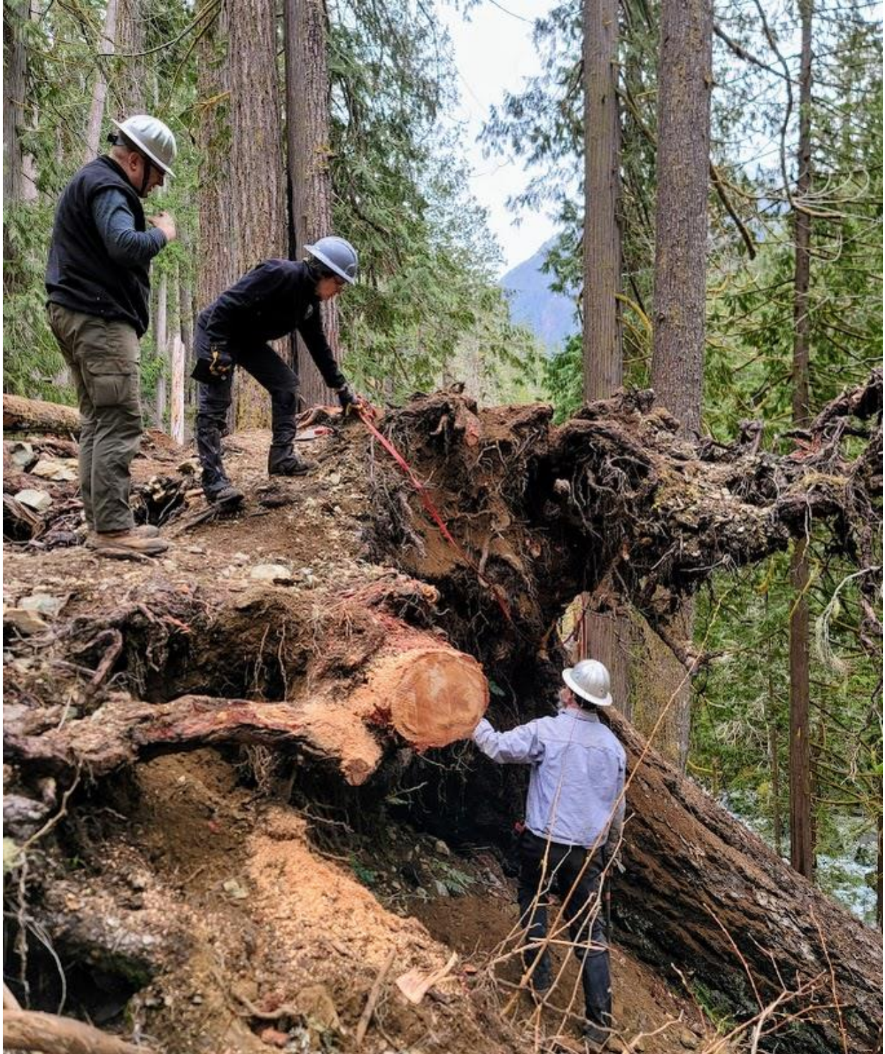
PASSING A STRAP UNDER A LARGE ROOT SO WE COULD CLEAN IT OFF FOR CUTTING.