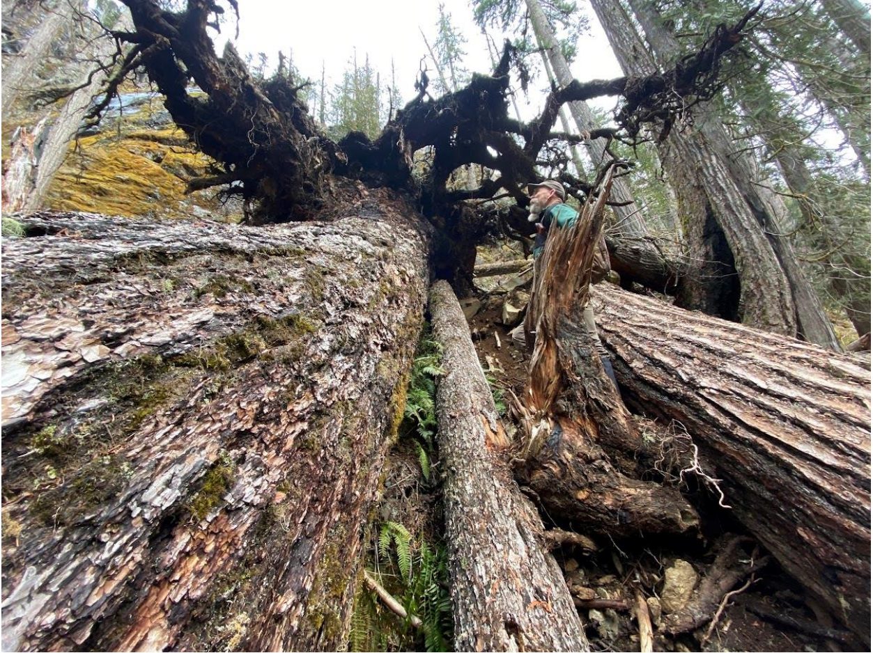
A CLOSER LOOK WHILE ANALYZING TO MAKE OUR CUT PLAN.