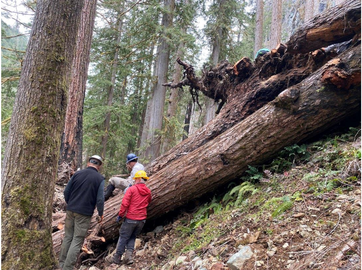
STARTING WORK DOWN BELOW. REMOVING THE LARGE ROOT MASSES THAT CAME DOWN FROM ABOVE.