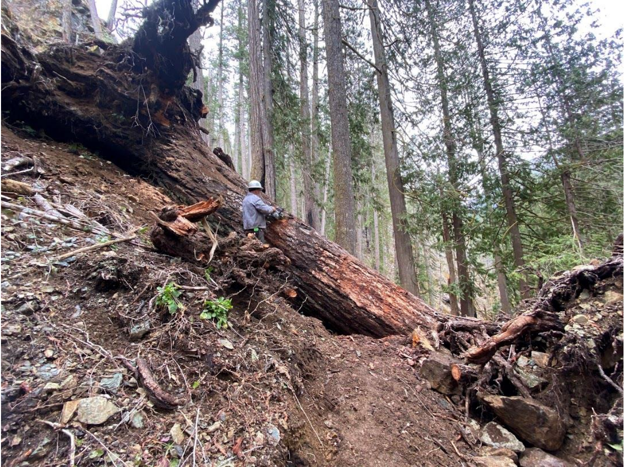
SCORING THE BARK TO MAKE IT EASIER TO REMOVE. GOOD ESCAPE ROUTE CLEARED OUT SO IT'S READY FOR CUT DAY.