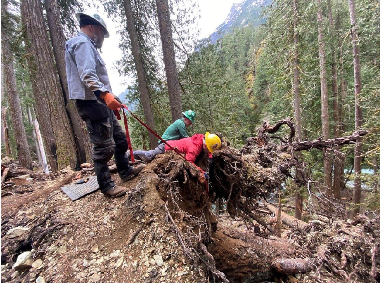
FEEDING THE STRAP UNDER THE ROOT.