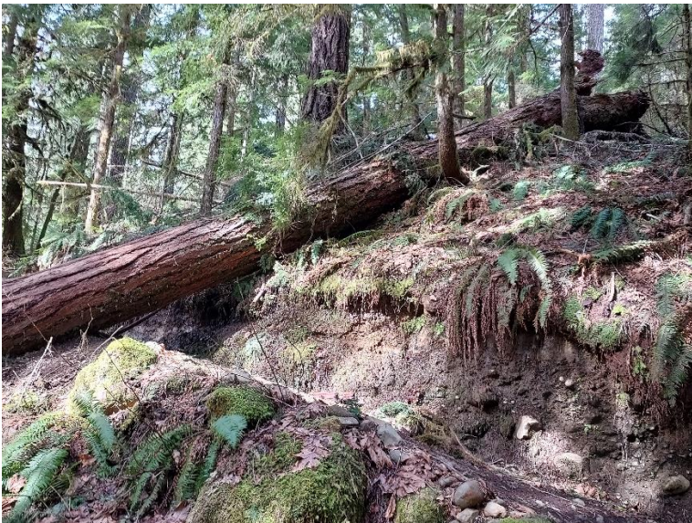
Detached base, steep hillside.