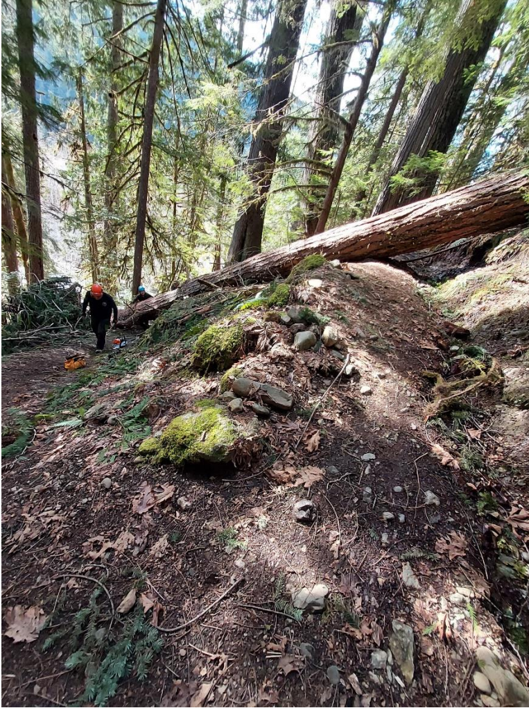
Our problem tree.