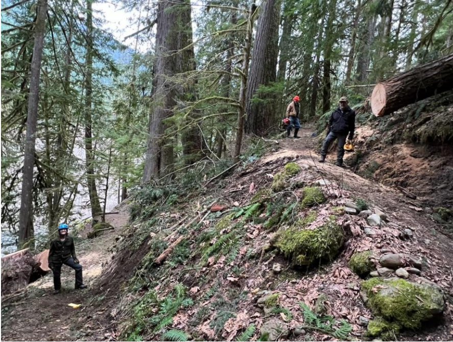
Finished product. Completely passable for loaded stock.