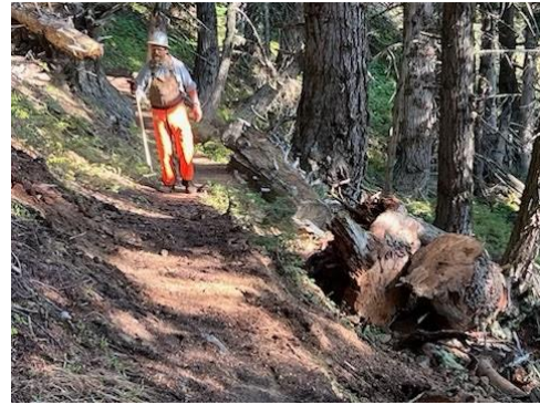
Top left: picture taken of the leaner from the downtrail side last fall (2022) when we first scouted this.