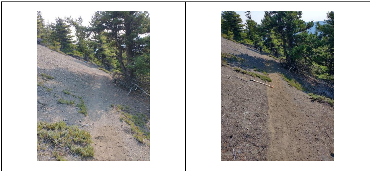
Typical before and after of tread that's been re-established.

Another side note: in looking at the picture, we need to find a way as a Gray Wolf crew to get matching hard hats with our logo on it – just to avoid confusion. I'll work on that. 😊