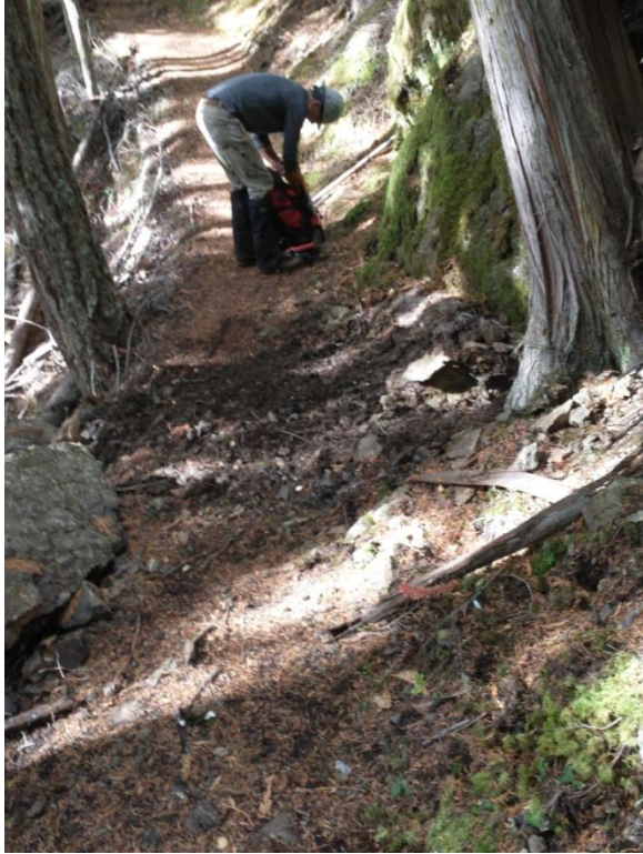
Impeding boulders smashed and removed from trail