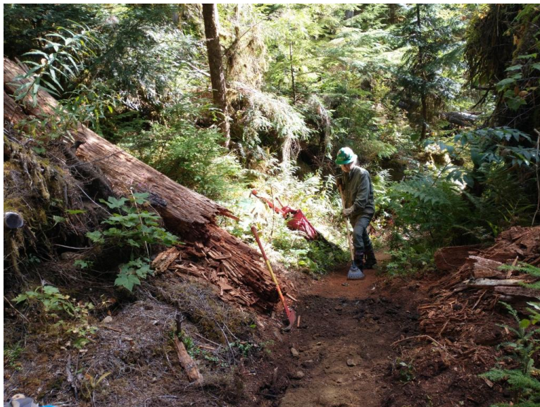
Fallen rotten trunk cleared and dug away