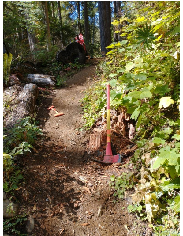
Impaled log reduced in height