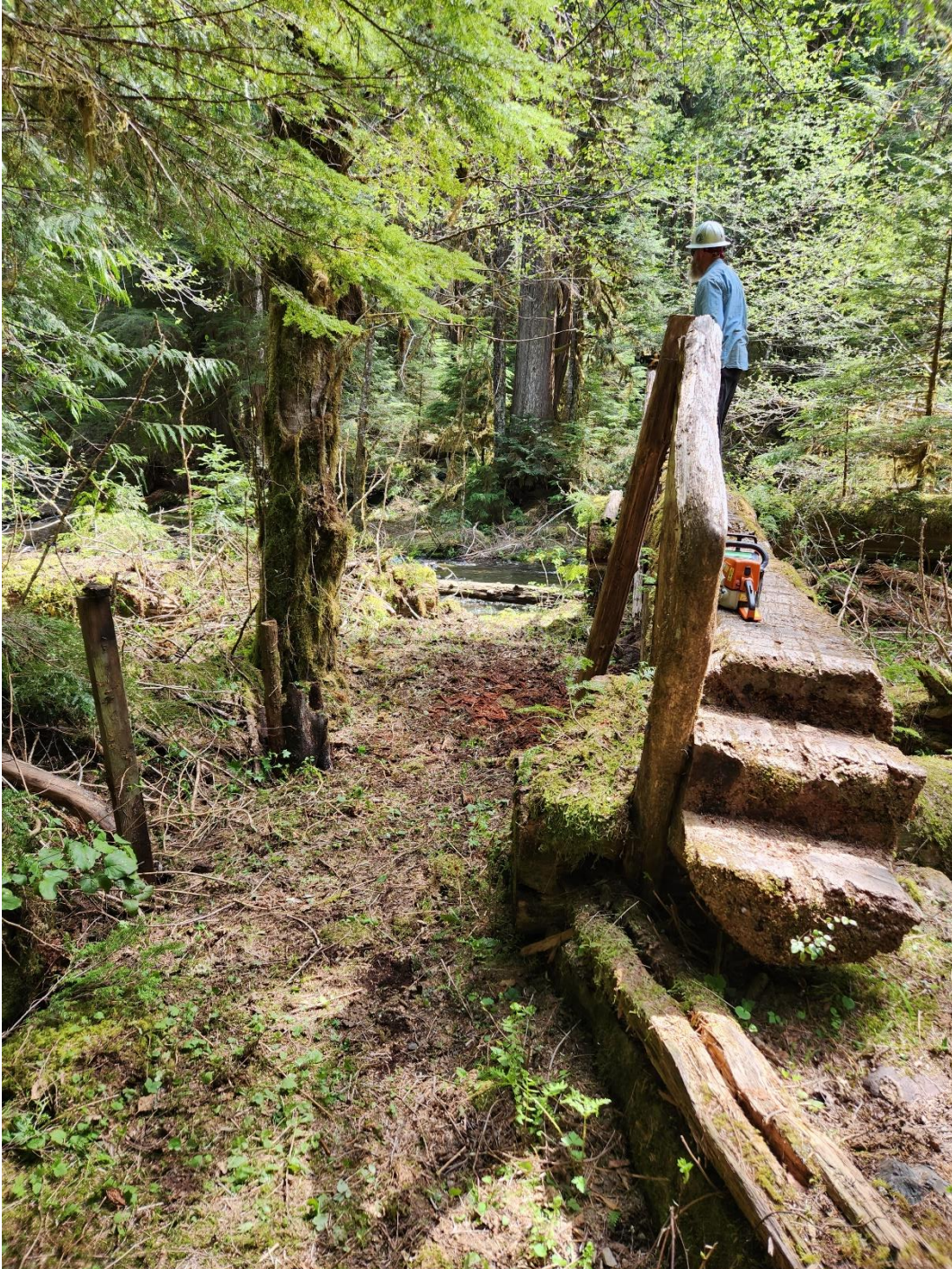
PAUL GETTING READY TO WORK ON CLEARING THE STOCK FORD AT RULE CREEK (UPPER SKOK). THEY CLEARED THE FIRST MILE OF THE UPPER SKOK, TO WHERE THE BIG "NATURAL" FOOTLOG IS. RULE CREEK IS RIGHT BEFORE THAT AND HAS HAD ITS STOCK FORD BLOCKED FOR A LONG TIME.