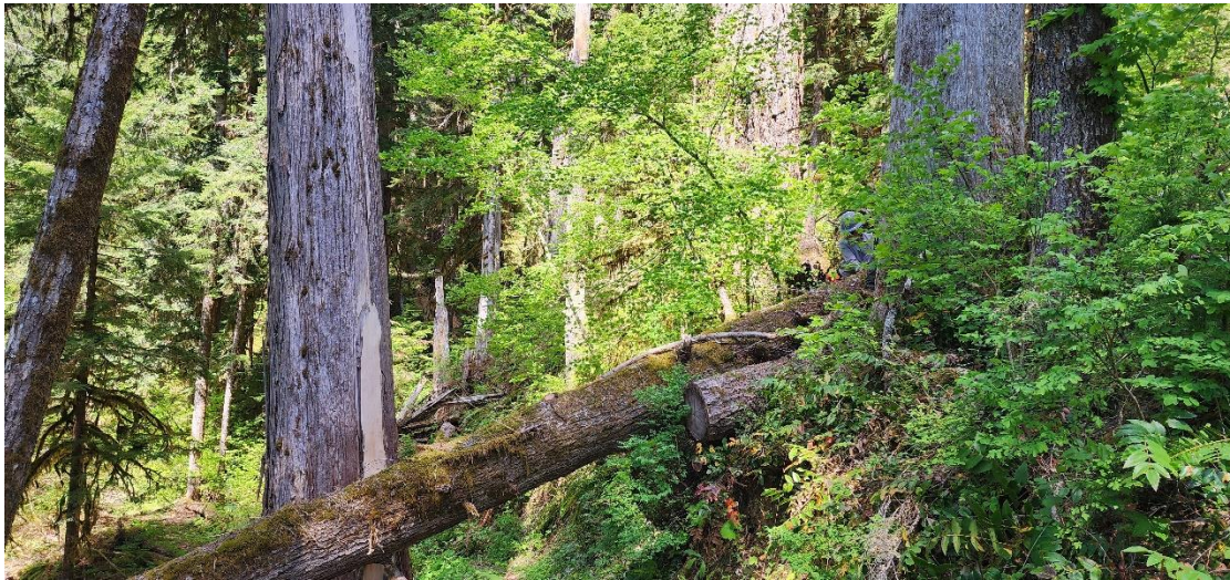
DUE TO THE HEIGHT OF THE TREES (TOO LOW FOR STOCK BUT TOO HIGH TO CUT), WE HAD TO CLEAR OUT A BUNCH OF STUFF AND CUT FROM UP ON THE HILLSIDE TO RELEASE IT. SORRY, I DON'T HAVE AN AFTER PICTURE, BUT IT IS CLEARED TO STOCK STANDARDS NOW.