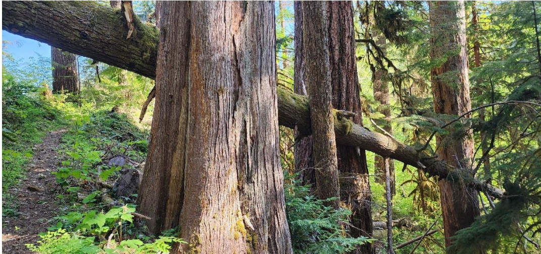
THE OTHER END. BOUND BETWEEN TWO TREES AND SUSPENDED.