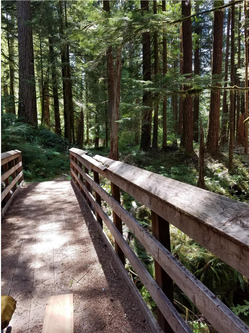
AN EXAMPLE OF SOME OF THE DAMAGE.