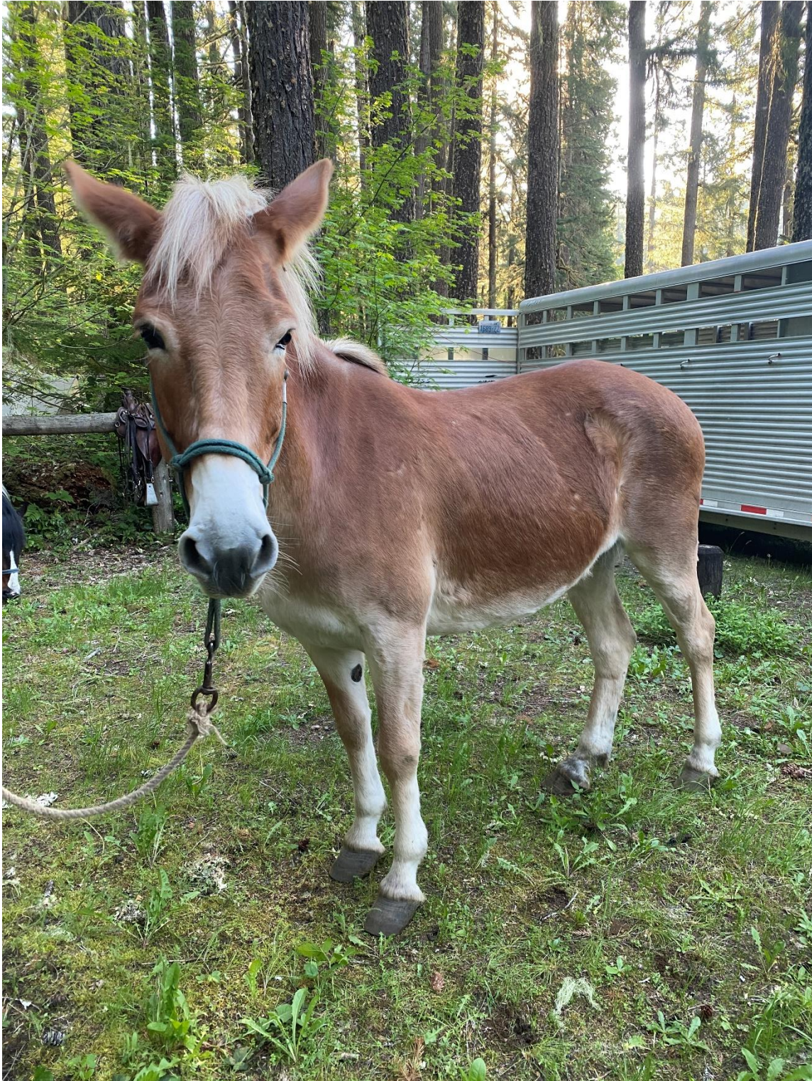
MEET BELLE. SHE IS SUPER CUTE. SHE IS WORKING ON LEARNING TO BE CALMER AROUND PEOPLE AND ACTIVITY.