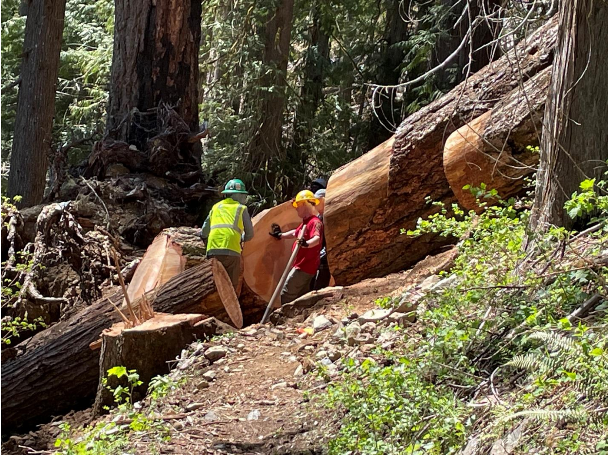
REMOVING ROUNDS FROM THE FIVE FOOT TREE.