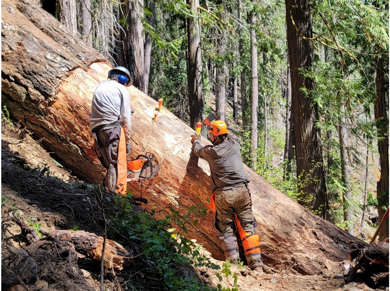
WEDGES CAME IN HANDY MANY TIMES.