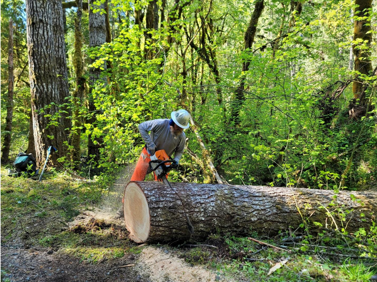
ONCE WE RELEASED IT, WE HAD TWO SAWS GOING ON THIS TREE TO MAKE SHORT WORK OF IT. WE NEEDED TO GET GOING TO THE JOBSITE.