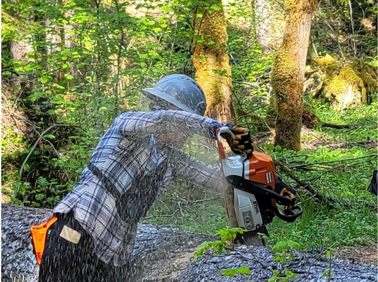
THIS WAS A TREE THAT CAME DOWN BETWEEN THE HUMPS AFTER OUR LAST PREP DAY. 32" WITH SOME SIDE AND BOTTOM BIND. WE HAD TO CLEAR THIS TO GET THE STOCK THROUGH.