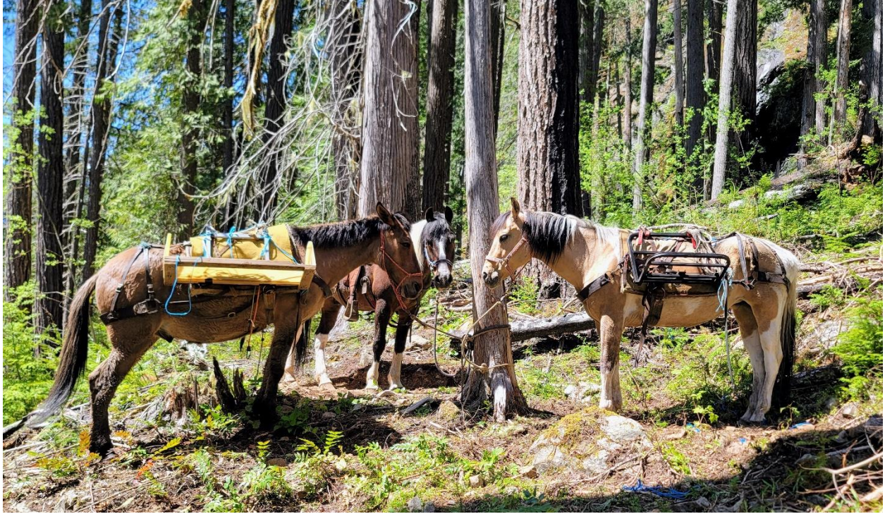
KATY, ARCHIE AND MAGIC WAITING PATIENTLY.