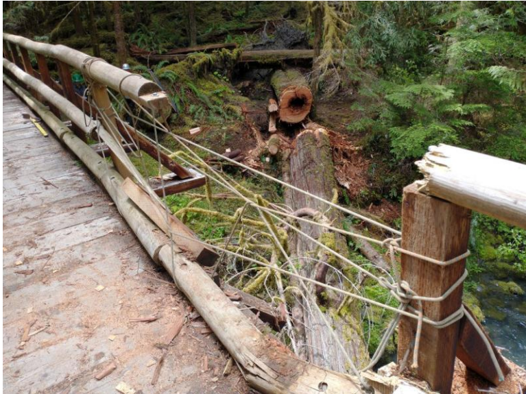
Far below: repaired and replaced railings May 2023