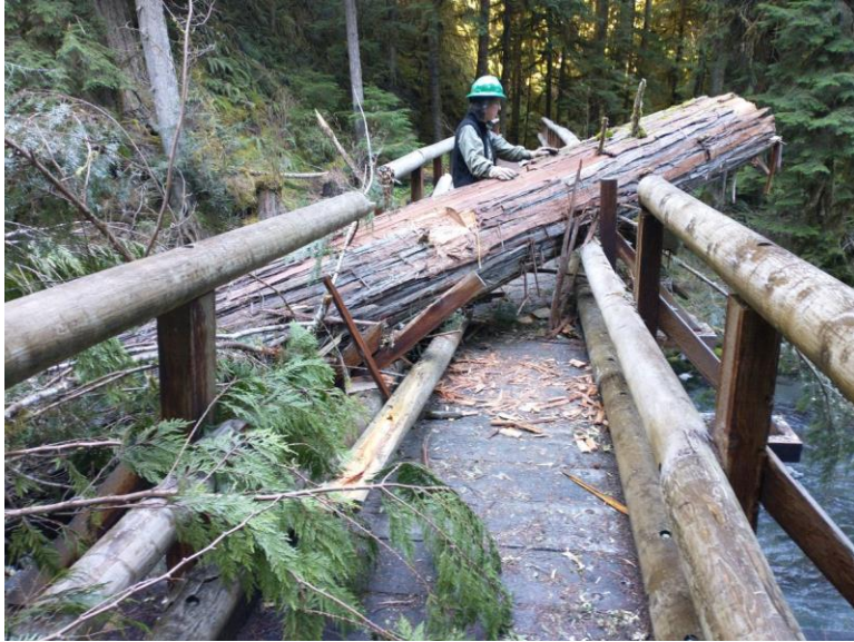
Left: Bridge status March 2022