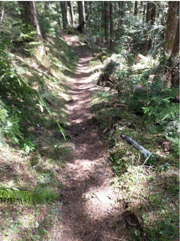
Before and after