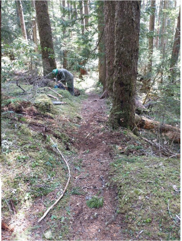
Fallen tree removed (before & after)