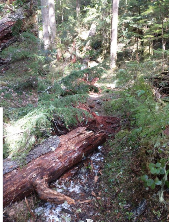
Rotten tree fallen along 50' of trail; path cleared