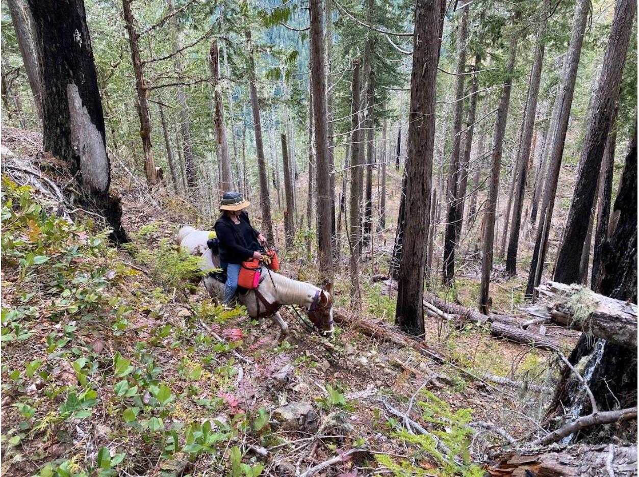
TAWYNA CALDWELL RIDING COPPER, THIS IS COMING DOWN OFF OF LUNCH ROCK ON THE WAY OUT.