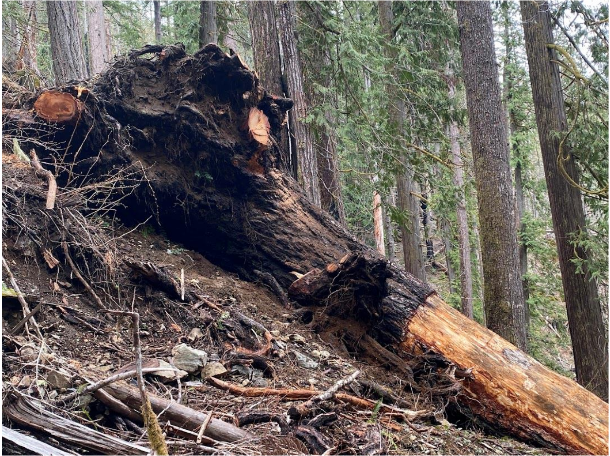
BARK CLEARED AND A LARGE SPACE CLEARED OUT UNDERNEATH. NOW IF IT WEREN'T FOR THAT ROOT ...