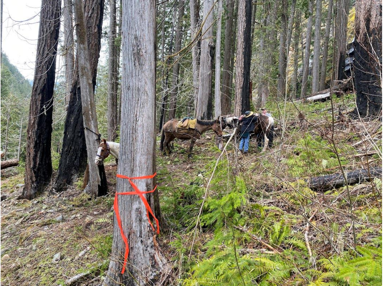
THIS IS WHERE THE ANIMALS WILL BE CHILLIN' WHILE WE CUT THE TREES.