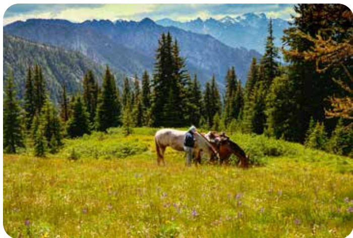
In the Lake Chelan-Sawtooth Wilderness.