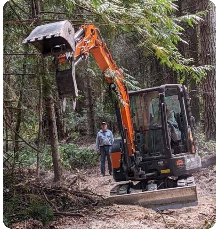
Dan Dosey operating excavator and Jim Hollatz assisting to refine trail tread.

trail building expertise. A skid-steer was rented to move some of the gravel to the necessary areas and members Jeff Chapman and Dan Dosey both brought small tractors to help one day. Small logs were harvested and peeled near the trail to meet the needs of side rails for the turnpike areas and several crews put in busy days with equipment at the end of August to get the gravel moved and turnpike areas completed.