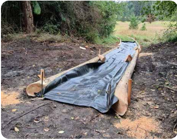
Construction of turnpike across a wet area.