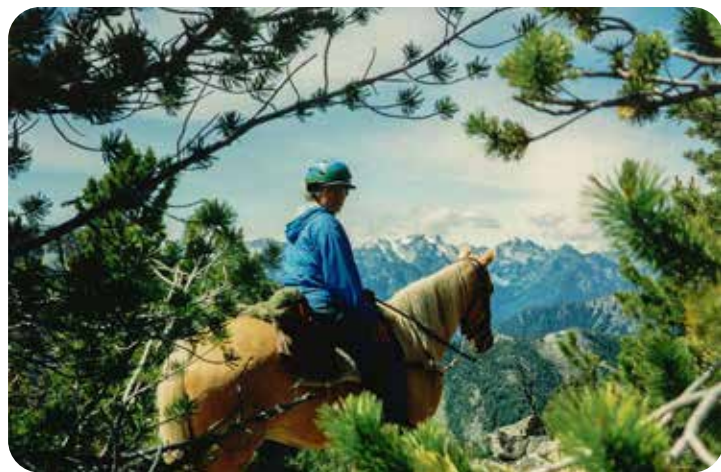
Riding in the Lake Chelan-Sawtooth Wilderness.