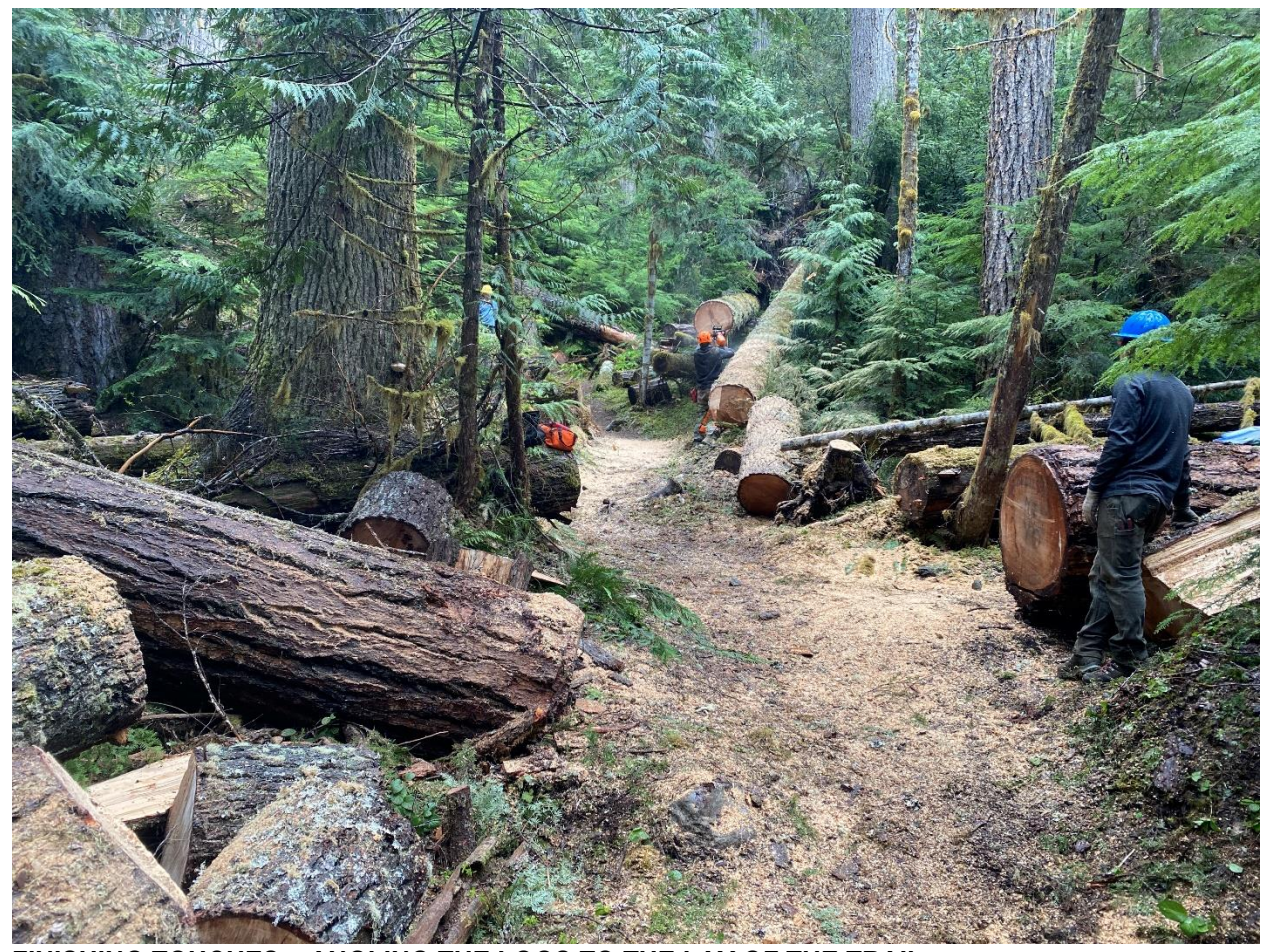
FINISHING TOUCHES - ANGLING THE LOGS TO THE LAY OF THE TRAIL.