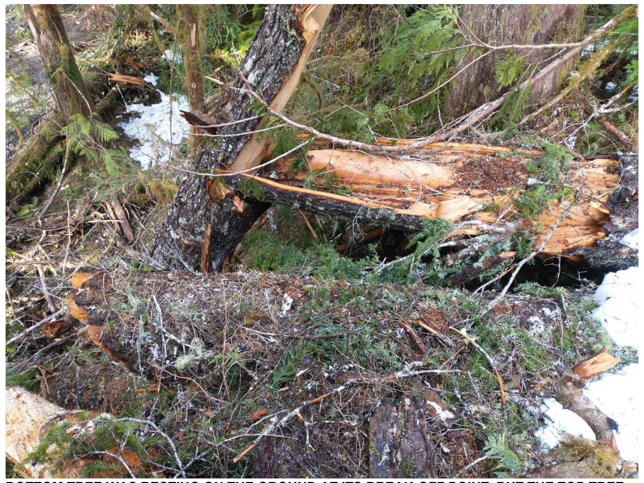
BOTTOM TREE WAS RESTING ON THE GROUND AT ITS BREAK-OFF POINT, BUT THE TOP TREE WAS SUSPENDED – NOT TOUCHING THE GROUND DUE TO THE FACT THAT IT ALSO BROKE BUT WAS ON TOP OF THE OTHER TREE. WE OPTED TO CUT OFF THE ENTIRE END OF THE TOP TREE FIRST, TO ELIMINATE THIS MESSY VARIABLE.