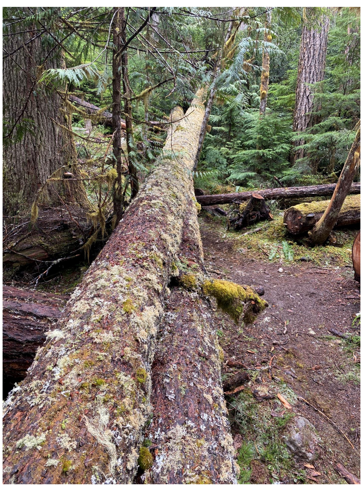
THE TOP TREE'S WEIGHT IS RESTING ON THE BOTTOM TREE.