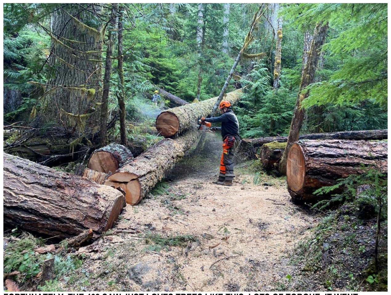
FORTUNATELY, THE 462 SAW JUST LOVES TREES LIKE THIS. LOTS OF TORQUE. IT WENT THROUGH THESE 30" LOGS LIKE A HOT KNIFE THROUGH BUTTER.