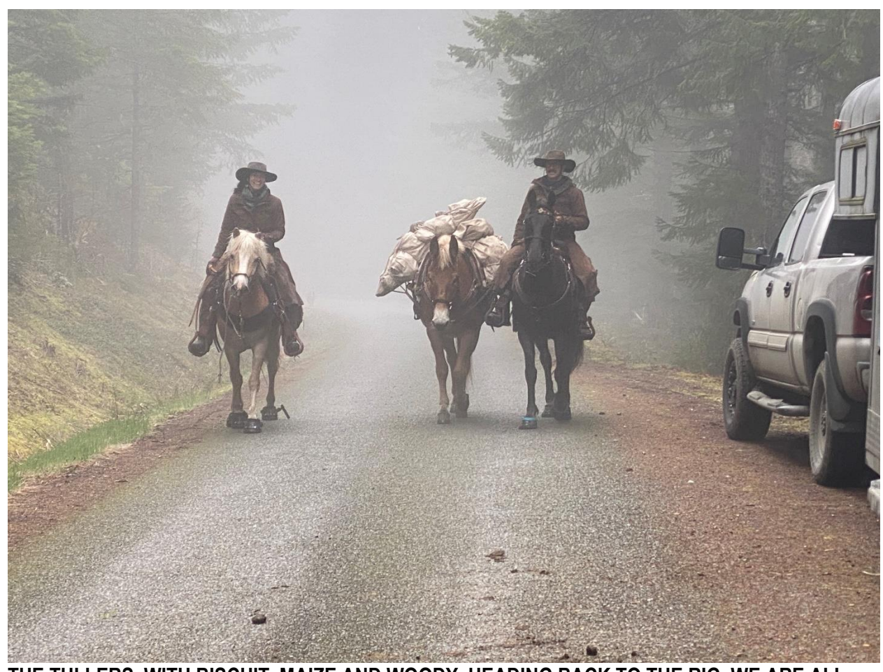
THE TULLERS, WITH BISCUIT, MAIZE AND WOODY, HEADING BACK TO THE RIG. WE ARE ALL THRILLED TO HAVE MADE THIS NEW PARTERSHIP!